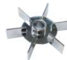
Rushton 6-Blade Impeller