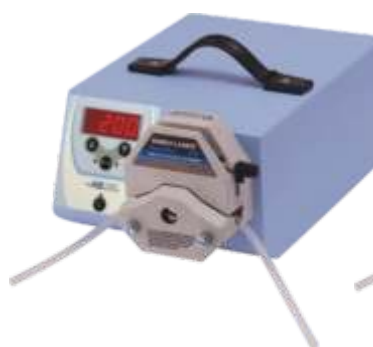
Cat. No. :MU-D01